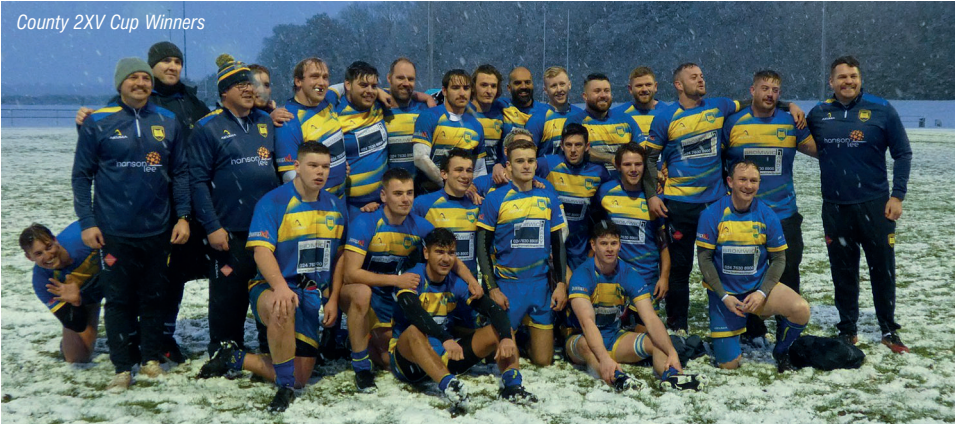
County 2XV Cup Winners